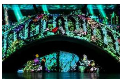
The Serenissima (mapping vidéo) 1 050 € excl. VAT

A combination of pool and poker. Throw 5 balls, cards appear and you have to make the best combination.