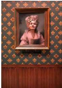
The Countess 1 person

Thanks to our photography backgrounds, your guests will be able to become real stars and present themselves in settings designed for our spaces. They'll be able to sit on the moon, turn into an astronaut or even a cancan dancer.