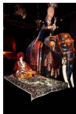
The flying carpet 1 person