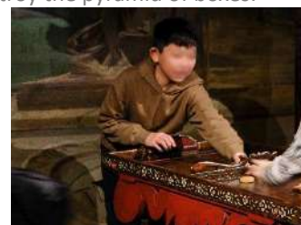
Rubber band table (x4) 520 € excl. VAT

An old game that involves throwing wooden balls into numbered holes to get the best score.