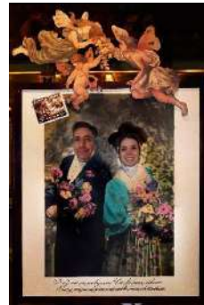
Postcard 2 persons