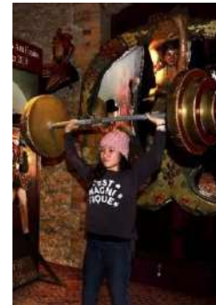
Dumbbell Photo accessory