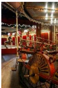
Image available as an A6 postcard (10.5 x 14.8 cm) and magnet (7.8 x 5.4 cm)

Image available as an A6 (10.5 x 14.8 cm) postcard only