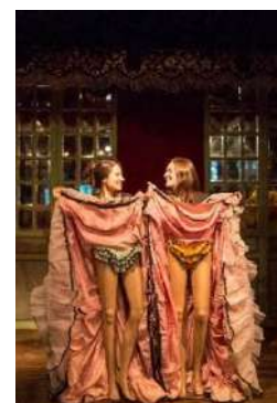
Le cancan 2 persons