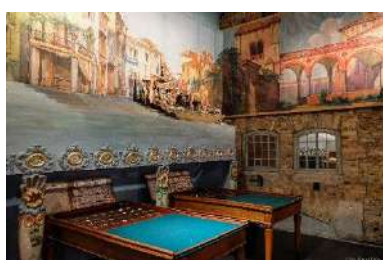
Venetian billiards(x2) 700 € excl. VAT

2 players have to get rid of their pucks by sliding them into the opponent's half.