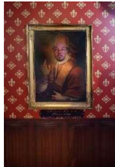
The Pope 1 person