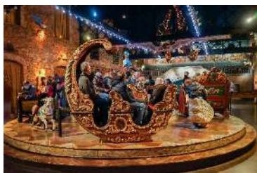
The gondola carousel 1 400 € excl. VAT

With the rental of this room we offer you the distorting mirrors, the Venetian photo backgrounds and the automaton show.