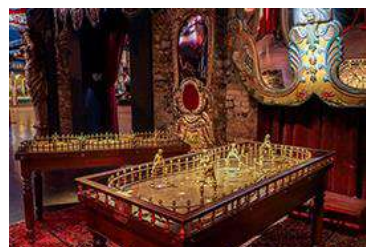
Dutch spinning top 520 € excl. VAT

Bouffe-balle: throw the ball into the characters' mouths to win points // Chamboule-tout: throw balls to destroy the pyramid of boxes.