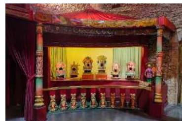
Bouffe-balle & chamboule-tout 860 € excl. VAT each

6 players throw their ball into the holes to make their gondola move forward