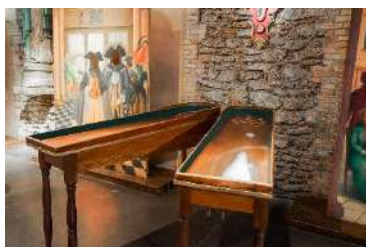
Japanese billiards (x2) 520 € excl. VAT

The aim of this game of chance is to ring the bell using a spinning top.