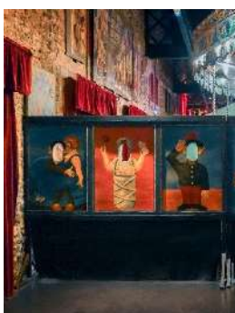
Characters 3 persons