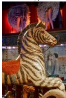
Image available as an A5 postcard (10,5 x 14,8 cm) and magnet (7.8 x 5.4 cm)

Image available as an A6 (10.5 x 14.8 cm) postcard only