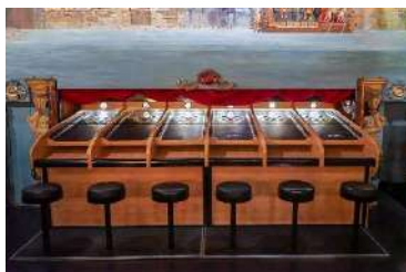
The gondola race 2 090 € excl. VAT

6 players throw their ball into the holes to make their gondola move forward