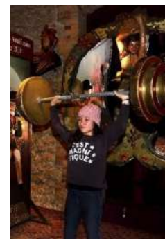
Dumbbell Photo accessory