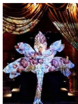
Flower lady 1 person