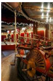
Image available as an A6 postcard (10.5 x 14.8 cm) and magnet (7.8 x 5.4 cm)

Image available as an A6 (10.5 x 14.8 cm) postcard only