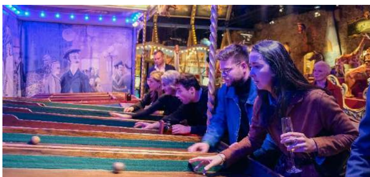
Billiard Game Stalls