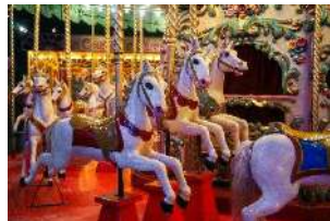
Image available as an A6 postcard (10.5 x 14.8 cm) and magnet (7.8 x 5.4 cm)