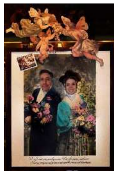
Postcard 2 persons