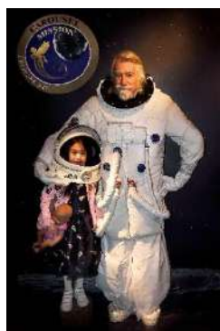
The astronaut 1 or 2 person(s)