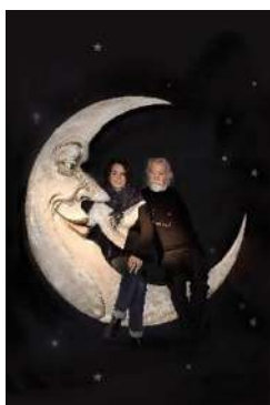
The Moon 1 or 2 person(s)