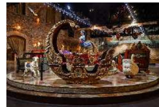
Image available as an A6 postcard (10.5 x 14.8 cm) and magnet (7.8 x 5.4 cm)