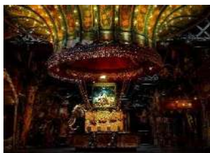
Image available as A5 (14.8 x 21 cm) and A6 (10.5 x 14.8 cm) postcards and magnet (7.8 x 5.4 cm)

Image available as a magnet only (7.8 x 5.4 cm)