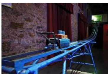
Strength Game: torpedo Style

Shooting stand + Massacre Game: 1 400 € excl. VAT