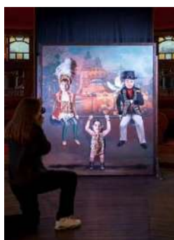
The weightlifter 3 persons