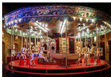
Wooden horses carousel