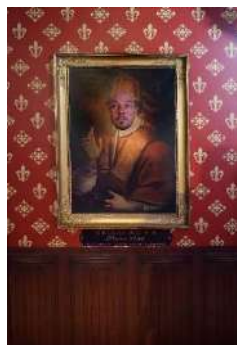
The Pope 1 person