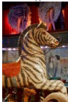
Image available as an A5 postcard (10,5 x 14,8 cm) and magnet (7.8 x 5.4 cm)

Image available as an A6 (10.5 x 14.8 cm) postcard only