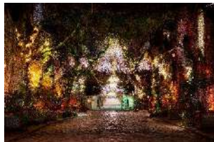
Image available as an A6 postcard (10.5 x 14.8 cm) and magnet (7.8 x 5.4 cm)

Image available as an A6 (10.5 x 14.8 cm) postcard only