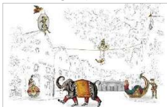
Image available as an A6 postcard (10.5 x 14.8 cm) and magnet (7.8 x 5.4 cm)

Image available as A5 (14.8 x 21 cm) and A6 (10.5 x 14.8 cm) postcards and magnet (7.8 x 5.4 cm)