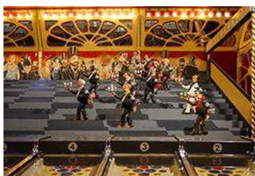
« Garçons de café » race