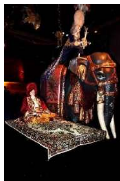
The flying carpet 1 person