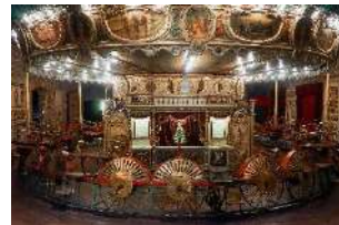
Image available as an A6 postcard (10.5 x 14.8 cm) and magnet (7.8 x 5.4 cm)