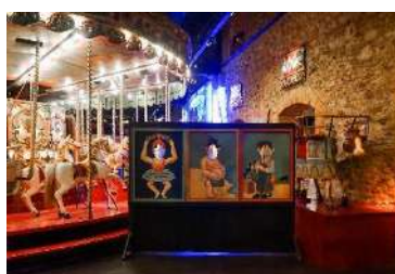
Fairground photo backdrops