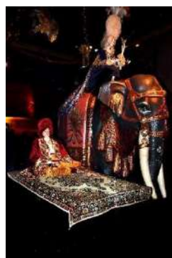
The flying carpet 1 person