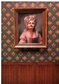
The Countess 1 person

Thanks to our photography backgrounds, your guests will be able to become real stars and present themselves in settings designed for our spaces. They'll be able to sit on the moon, turn into an astronaut or even a cancan dancer.