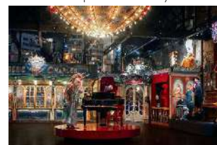
Image available as magnet only