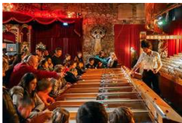
The horse race