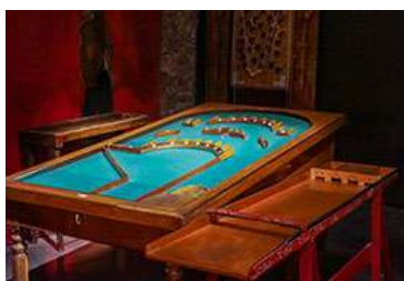
Les jeux d'adresse