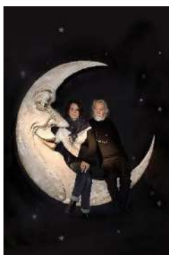
The Moon 1 or 2 person(s)