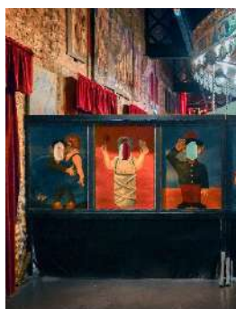
3 caracters 3 personnes