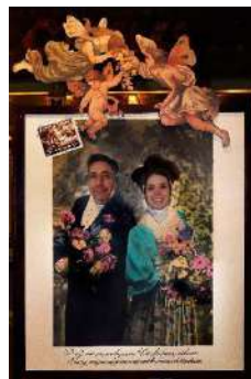
Postcard 2 persons