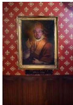
The Pope 1 person