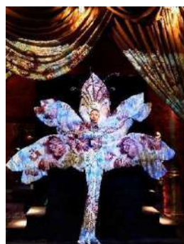
Flower lady 1 person