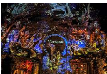
The unicorn zodiac game

The aim of this game of chance is to ring the bell with a spinning top.