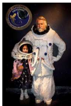
The astronaut 1 or 2 person(s)