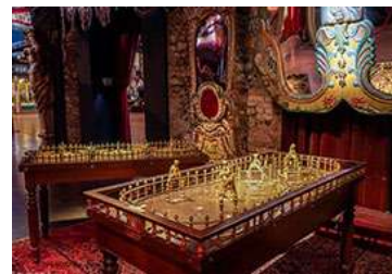
Dutch spinning tops (x3)

With dart rifle, hit targets to open boxes and see automatons