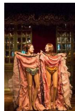
Le cancan 2 persons