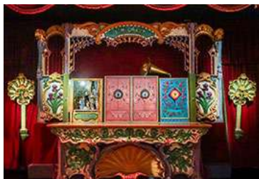
Marengi shooting gallery

12 players throw their balls into the holes to move their horses forward