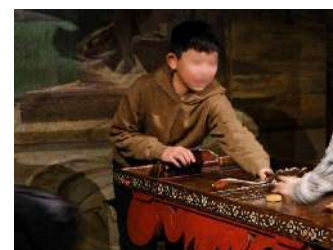
Rubber band table (x4) 520 € excl. tax

An old game that involves throwing wooden balls into numbered holes to get the best score.