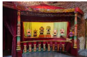
Le bouffe-balle & le chamboule-tout 860 € excl. tax each

6 players throw their ball into the holes to make their gondola move forward