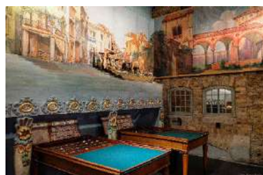
Venetian billiards(x2) 700 € excl. tax

2 players have to get rid of their pucks by sliding them into the opponent's half.