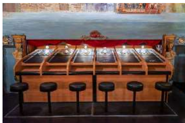
The gondola race 2 090 € excl. tax

6 players throw their ball into the holes to make their gondola move forward