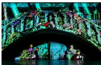
The Serenissima (mapping vidéo) 1 050 € excl. tax

A combination of pool and poker. Throw 5 balls, cards appear and you have to make the best combination.