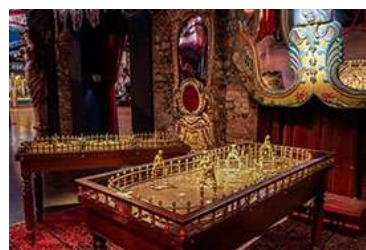
Dutch spinning top 520 € excl. tax

Bouffe-balle: throw the ball into the characters' mouths to win points. Chamboule-tout: throw balls to destroy the pyramid of boxes