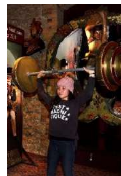
Dumbbell Photo accessory