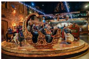
The gondola carousel 1 400 € excl. tax

With the rental of this room we offer you the distorting mirrors, the Venetian photo backgrounds and the automaton show.