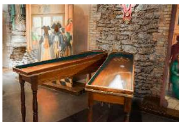
Japanese billiards (x2) 520 € excl. tax

The aim of this game of chance is to ring the bell using a spinning top.