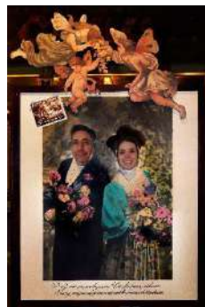
Postcard 2 persons