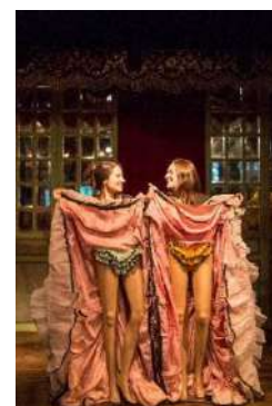
Le cancan 2 persons